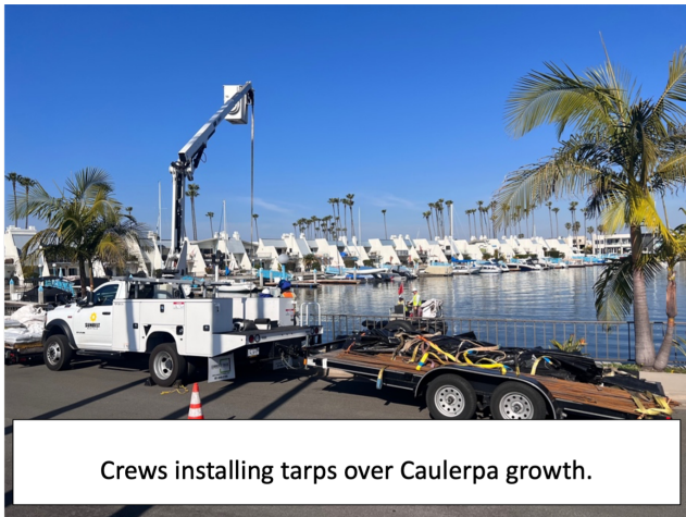
Crews installing tarps over Caulerpa growth.

3. Caulerpa mitigation under a combined agency effort is well underway and we do not expect it to interfere with our construction effort.